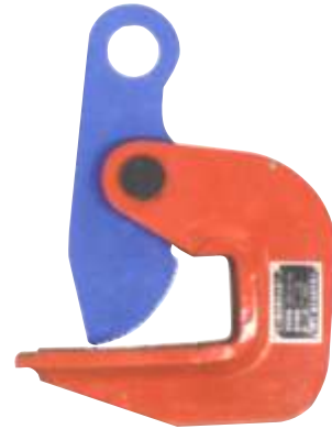
Model : DHQ