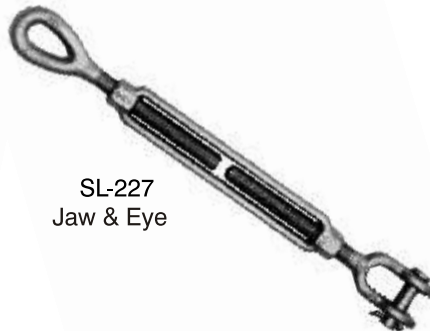
SL-227 Jaw & Eye