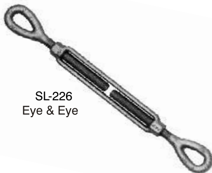
SL-226 Eye & Eye

* Proof load is 2 times Working Load Limit. Ultimate Load is 5 times Working Load Limit.