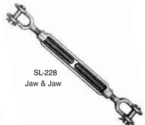
SL-228 Jaw & Jaw

Specifications given are indicative and are subject to change.