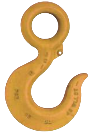
EYE HOOK SL-320