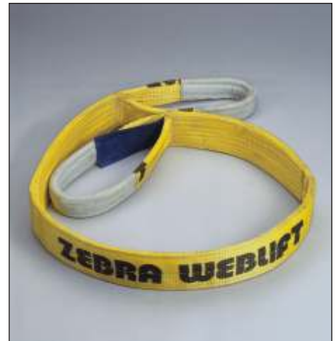
Duplex Webbing Sling with reinforced loops

* 100% Polyester double thickness webbing * Conforms to B.S. 3481 Part2 Factor safety for webbing 1:7