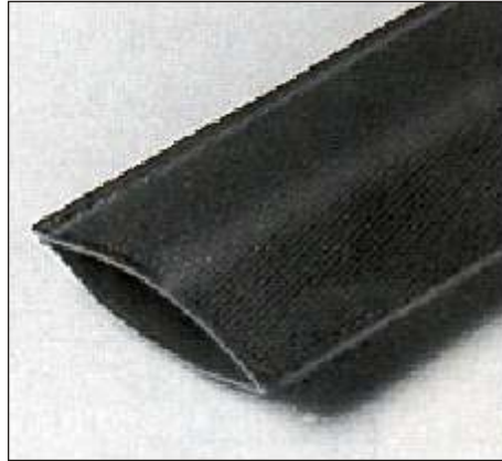
Anti-abrasion Webbing sleeve (AAWS)