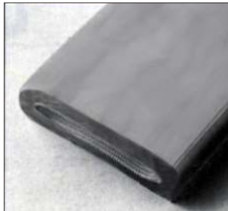
Sobitex double sided anti-cutting sleeve.