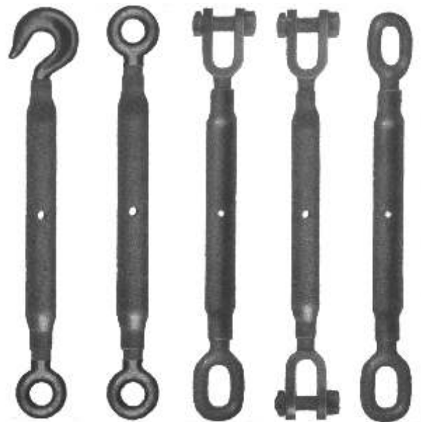
SLB 8 SLB 9 SLB 10 SLB 11 SLB 12

Refer IS : 6132 (Part II) 1972 for Dee Shackles